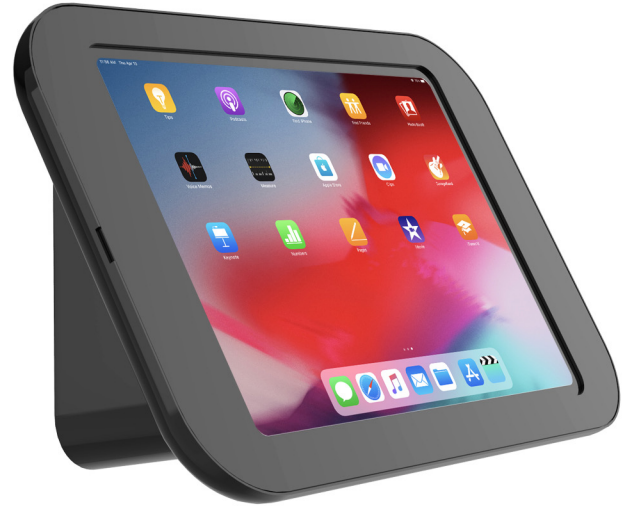
Wall Mounted Use

NOTE: iPad, charging cable and cable lock are not included.