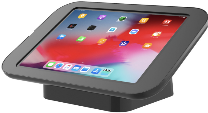
Counter Top Use

NOTE: iPad, charging cable and cable lock are not included.